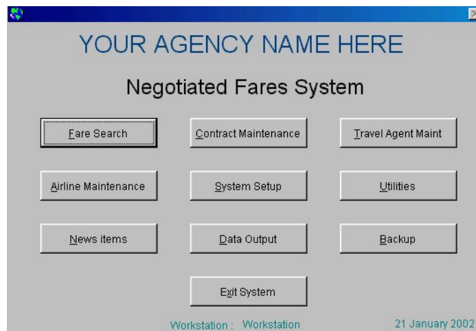
Fig 1. The main menu for the maintenance module

We have now "web enabled" this system. All external travel agency customers can now find the consolidated fares instantly without the need to make expensive telephone calls. When you purchase a licence we provide you with a system to display your fares to any agency you wish.